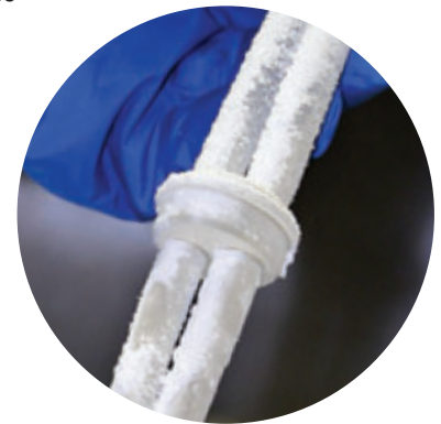
Available as molded BioClosure® container closures