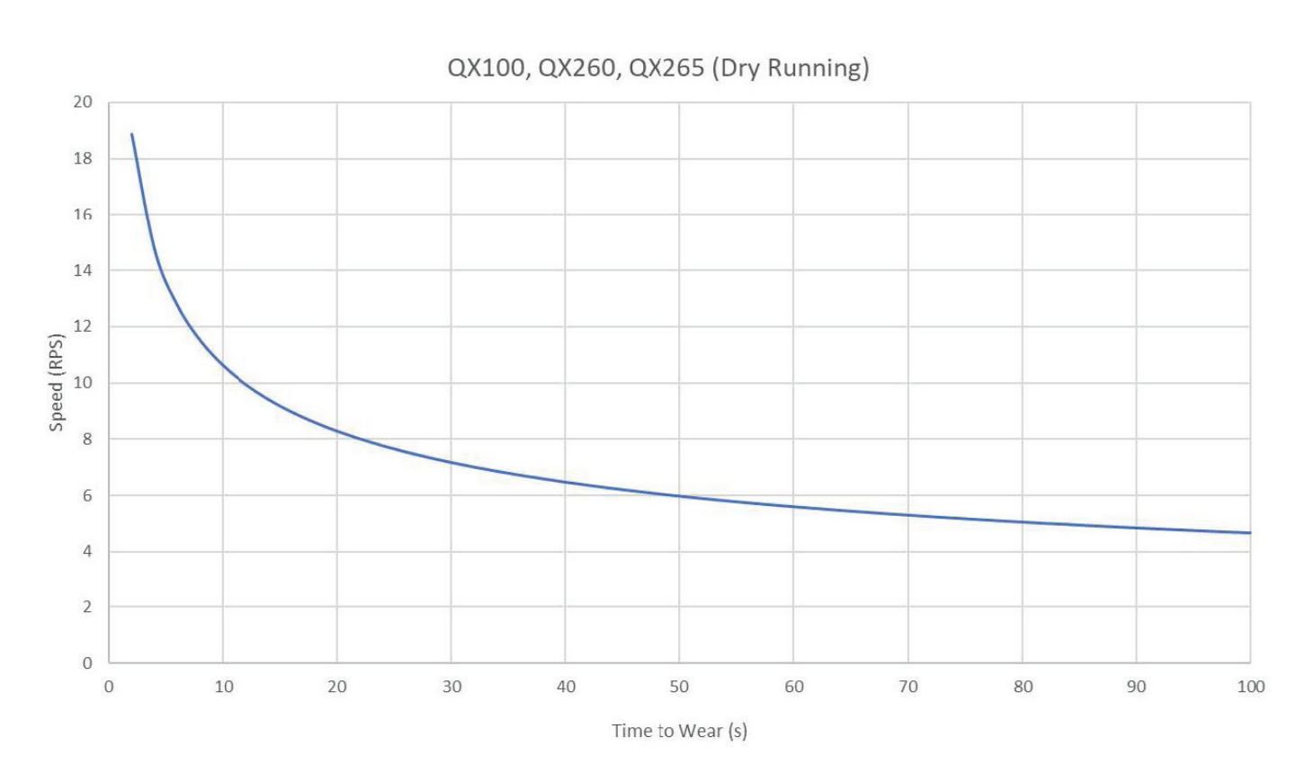
Chart showing that dry priming/running needs to be limited. Wear can occur quickly at high dry running speeds.